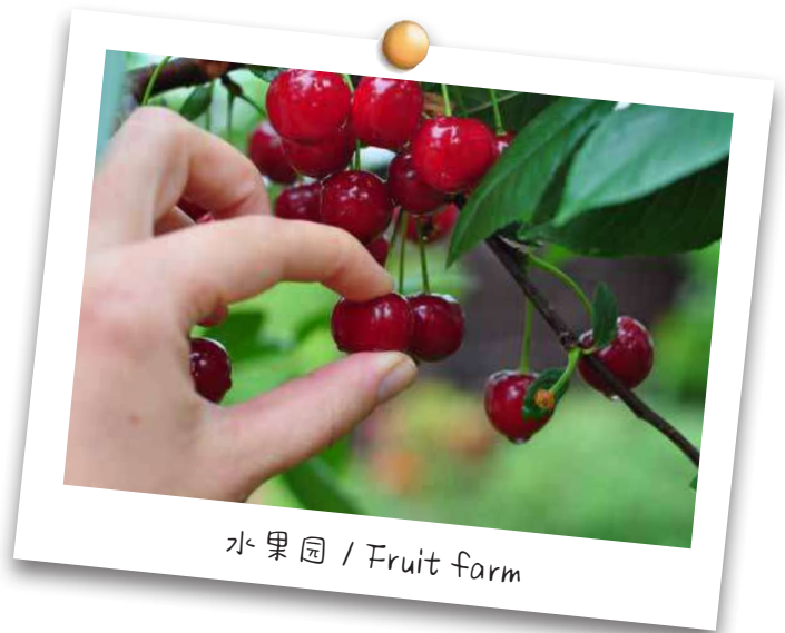
水果园 / Fruit farm

A small town surrounded by picturesque landscape of gently rolling hills and vast fields. Walk on the undulating hills as if you are walking into a Japanese drama scene.