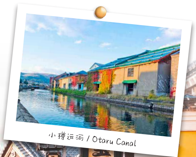
小樽运河 / Otaru Canal