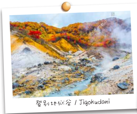
登别地狱谷 / Jigokudani