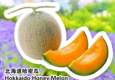
北海道哈密瓜 Hokkaido Honey Melon

※ Sequence of the itinerary is subject to change according to the final flight confirmation.