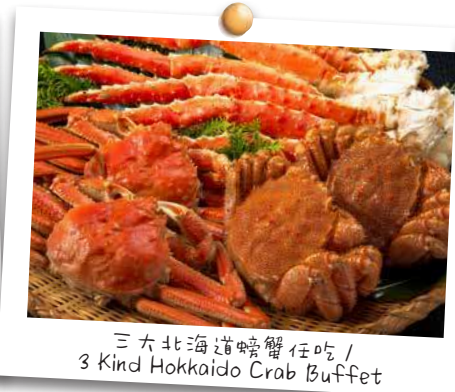
三大北海道螃蟹任吃 / 3 Kind Hokkaido Crab Buffet