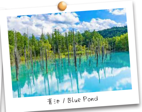
青池 / Blue Pond